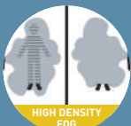
HIGH DENSITY FOG

Thanks to the massive insulation RAPID FOG fogging systems have a very low power consumption and can shoot for longer time in absence of mains power, temperature is constantly stable.