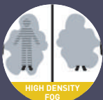
HIGH DENSITY FOG

Thanks to the massive insulation RAPID FOG fogging systems have a very low power consumption and can shoot for longer time in absence of mains power, temperature is constantly stable.