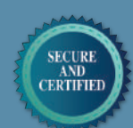
SECURE AND CERTIFIED

Removable and disposable fog cylinder, it is very easy to change and with a very competitive price.