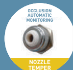
OCCCLUSION AUTOMATIC MONITORING

The most dense fog among all the fogging systems thanks to 80% of glycol in its fog fluid and the proprietary shooting technology.